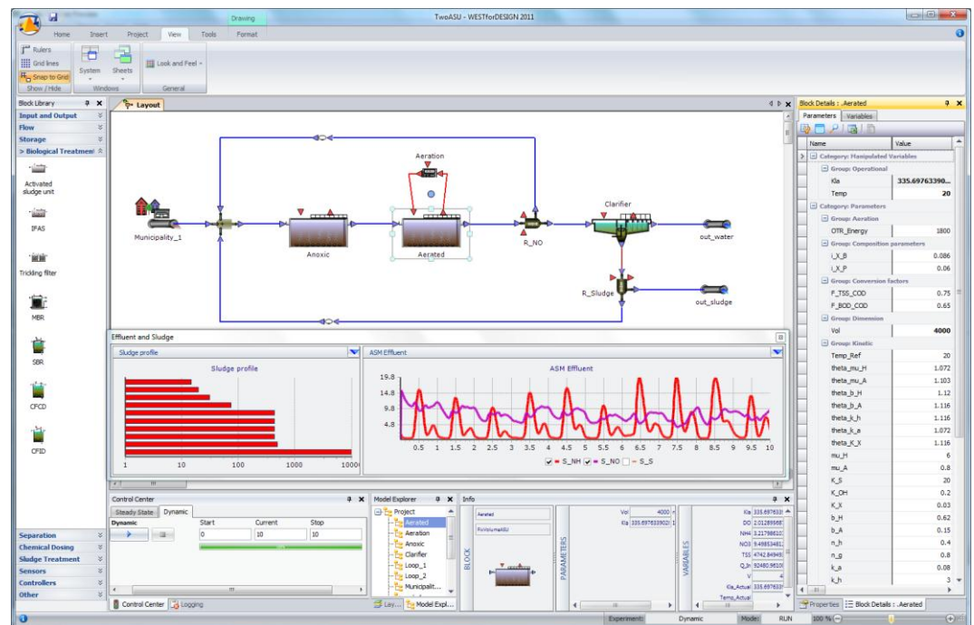
Figure 2.1 WESTforDESIGN

Based on state-of-the-art software technology, WESTforDESIGN allows for validation of design options and evaluation of different plant layouts in dynamic conditions. This is done by running scenarios, e.g. for high load and low load conditions, and by evaluating the effect of complex control strategies.